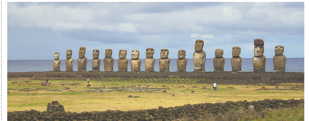
The moai statues on Easter Island were carved between approximately 1400 to 1650 A.D. by the natives of the island to honor chiefs or other important people who had passed away.

This content was compiled in collaboration with the embassy. The views expressed here do not necessarily reflect those of the newspaper.