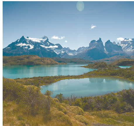
A panoramic view of Torres del Paine National Park, in Magellan's region, Southern Chile

Our existing, robust ties have even become stronger since the coronavirus appeared in March. Recently, the Japanese